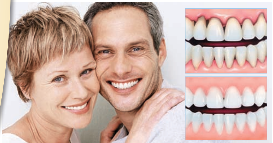
TOP: Without brushing and flossing, bacteria have the potential to damage your gums which could eventually lead to tooth loss.

The Surgeon General in his Report on Oral Health in America said that the mouth is the gateway to the body, that you cannot be healthy without oral health, and that oral and general health are inseparable. Together, we can prevent and sometimes reverse gum disease. Brush, floss, and keep regular preventive, diagnostic, and maintenance dental appointments.